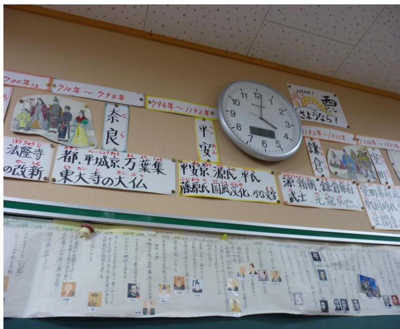
Figure 6: Wall decorations of kokusai kyositsu [International classrooms]

The walls of kokusai kyositsu are covered with words and pictures of the things that the students should know in Japan, such as Kanji [Chinese] characters, chronological timetable of events in Japanese history (Figure 6).