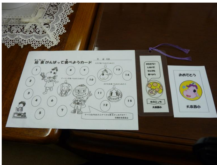
Figure 5: Cards and stickers to encourage healthy eating at school

In addition to assisting foreign students catching up academically, teachers at Nishi Elementary School support the physical development of foreign students. Some foreign pupils find difficulty getting used to kyushoku [school lunch that are provided to students everyday]. In order to encourage these students to be on a healthy diet, teachers have created cards and stickers with food (mostly vegetables) characters (see Figure 5) to reward the students when they finish off their meals (Oizumi Nishi Elementary School 2014c; interview with the principal, January 30, 2015).