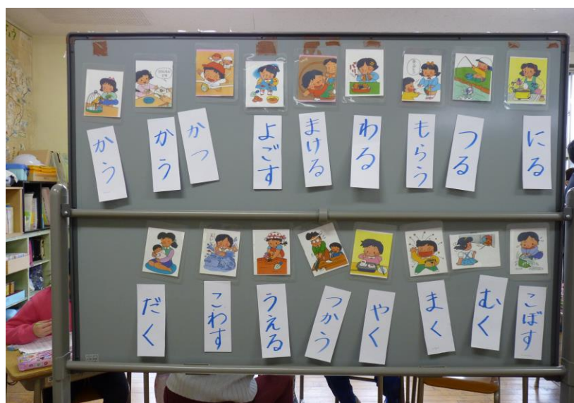
Figure 4: Japanese picture-word cards used in JSL classrooms

Nishi Elementary School is distinct from most other Japanese elementary schools in that it already has 20 years of experience in foreign student education. The course curricula and materials are well prepared by teachers themselves. Figure 4 is a Japanese picture-word card used in JSL classrooms that teachers at Nishi Elementary School created to facilitate the Japanese learning process of foreign students .