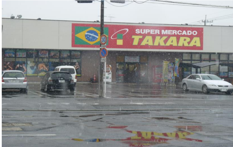
Figure 3: Brazilian Supermarket near Nishi Elementary School