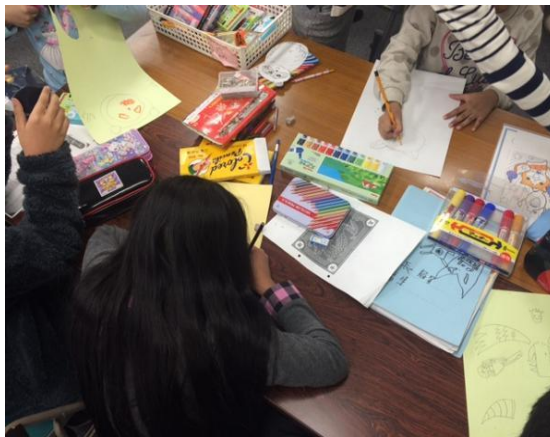
Figure 5: A handcraft class

Note: Not only main subjects but other ones, such as music, handcraft classes are