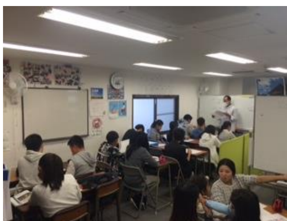
Figure 4: lessons

opportunity to meet other immigrant children refreshes them (interview, Dec. 29th, 2014). That contributes to their mental health and establishment of identity.